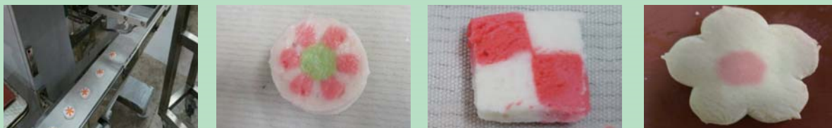
轉壓板 Plate Forming Device