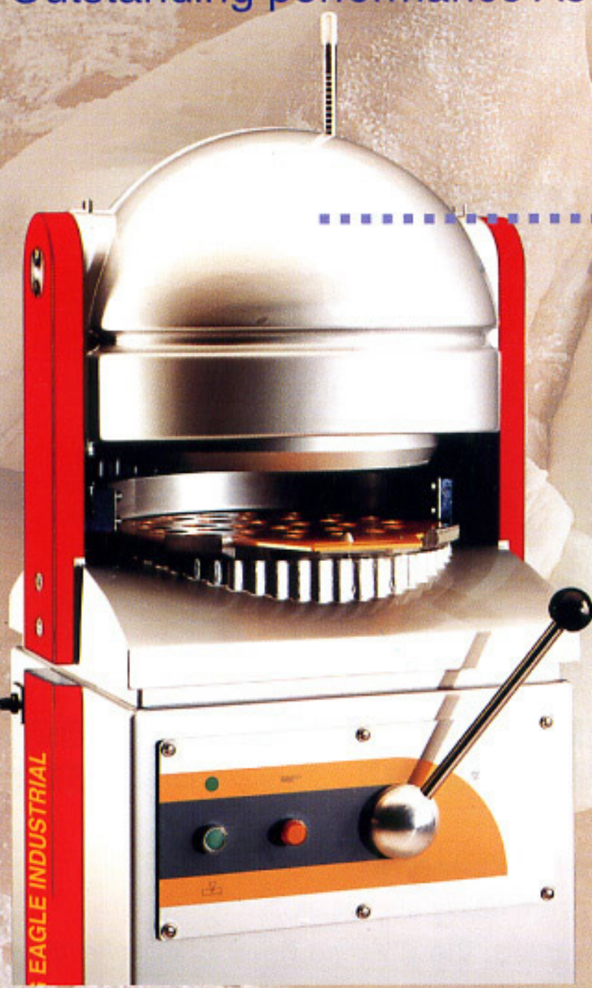
油壓分割手控滾圓機型 Hydraulic system

Outstanding performance As a Auto Dough Divider & Rounder